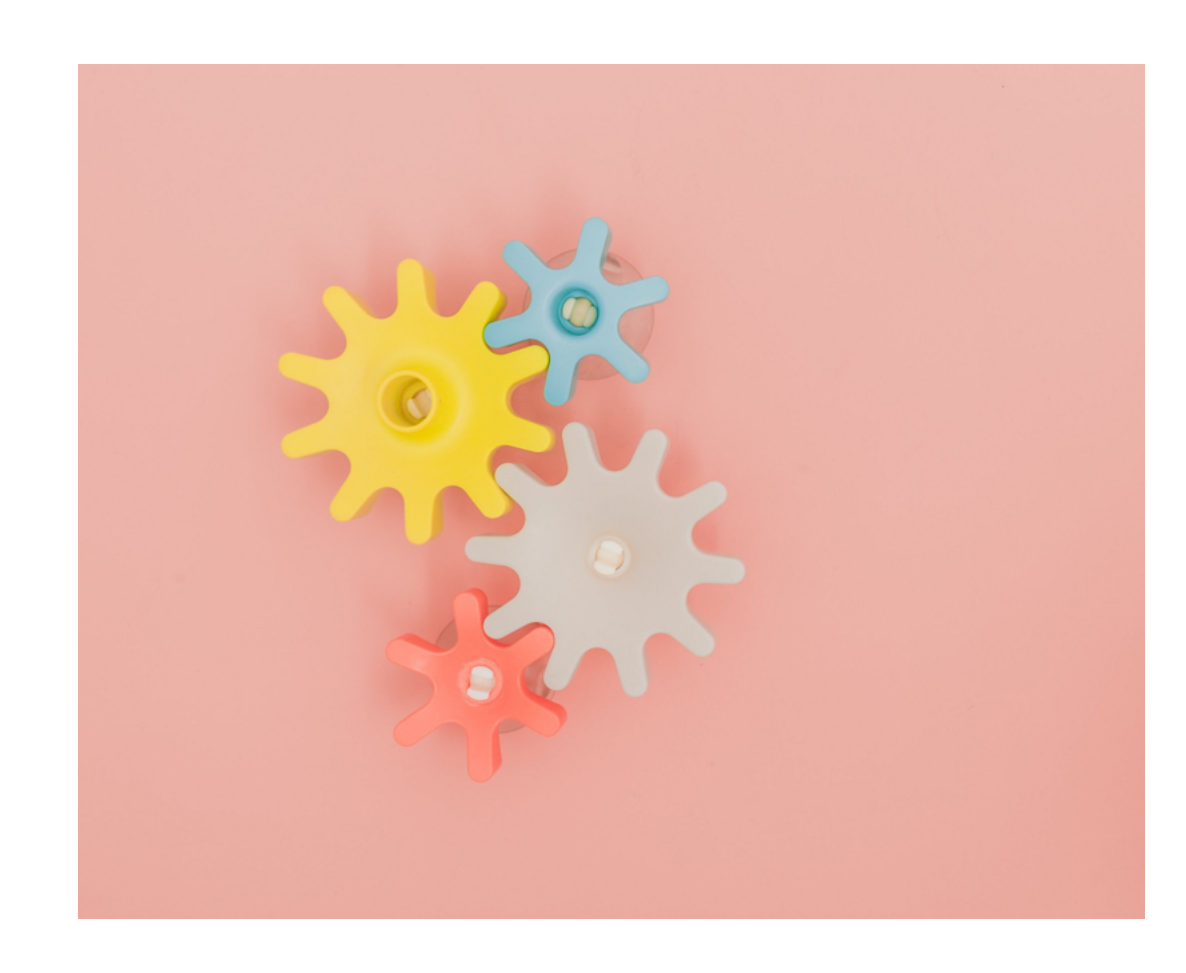
This week we have some great resources:

Check out <a href="https://selday.org">https://selday.org</a> and <a href="#SELDay">#SELDay</a> on social media.