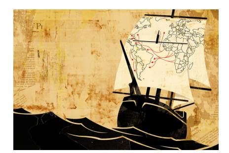
Teaching Hard History: Grades K-5

what they are reading and seeing. That said, before committing to teach these