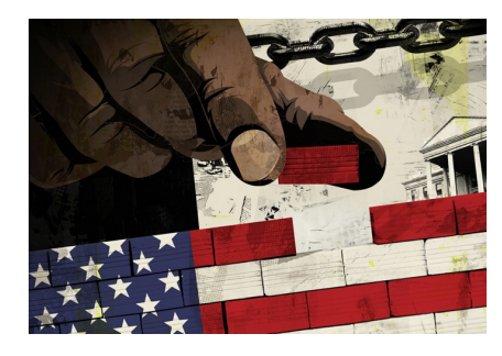
Teaching Hard History: Grades 6-12